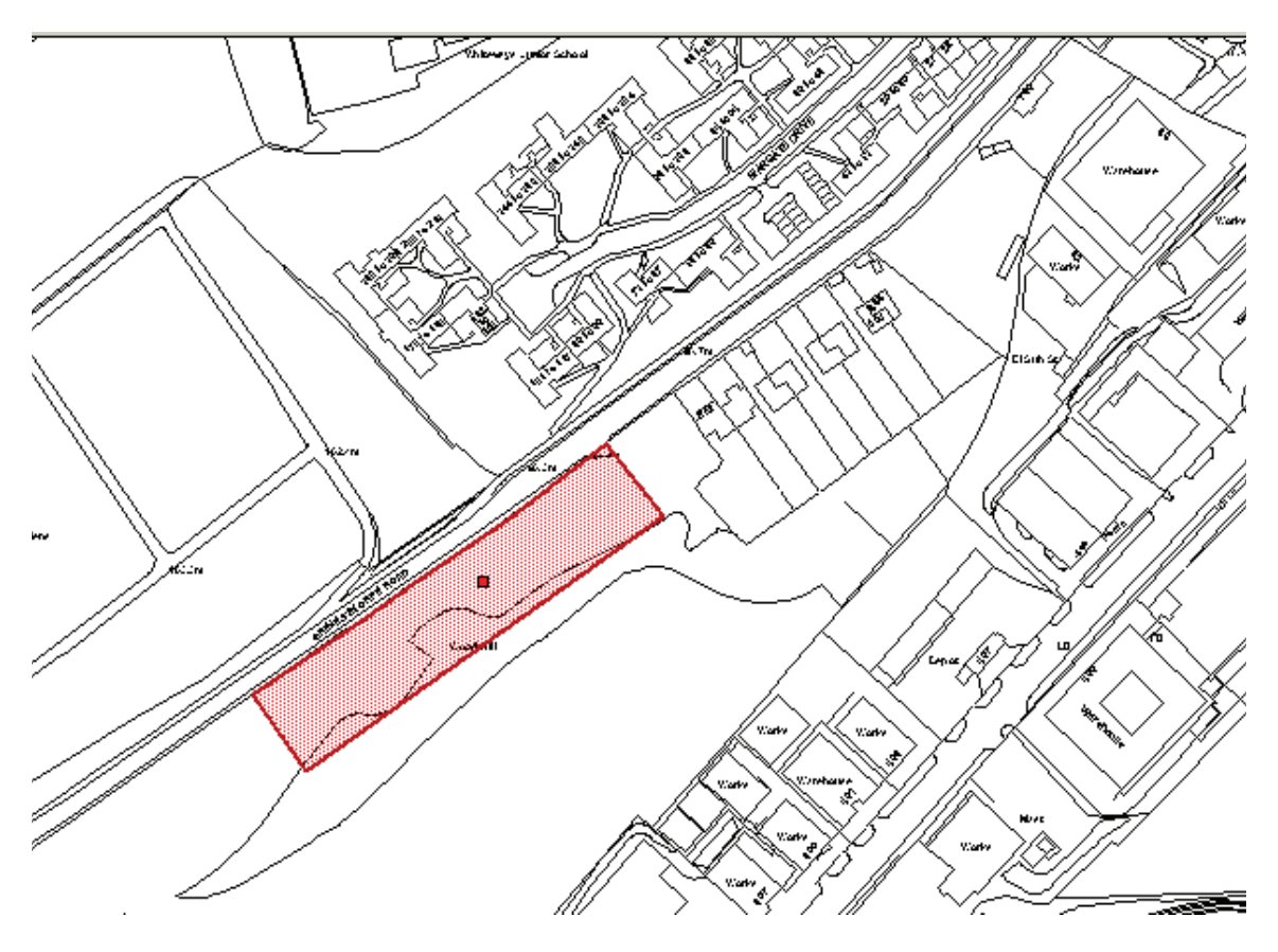
© Crown copyright and database rights 2011 Ordnance Survey 10018816